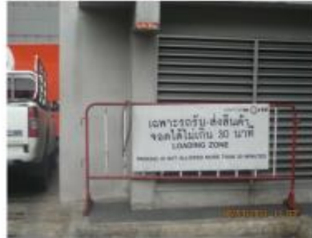
Parking is not allowed more than 30 minutes at loading zone. สามารถจอดรถรับ-ส่งสินค้า จุดนี้ได้ไม่เกิน 30 นาที