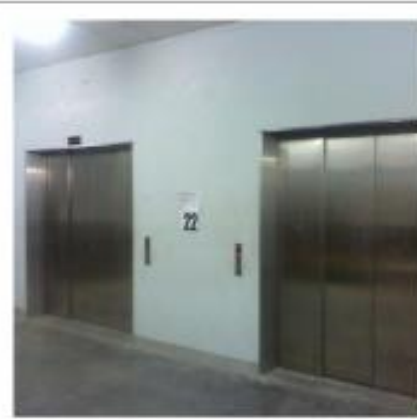
Area in front of the 2 cargo lifts level 22 ชั้น 22 ที่ตั้งบริเวณหน้าลิฟท์ขนส่งของชั้น 22