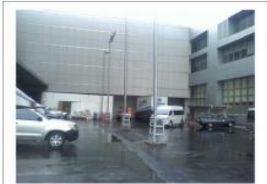
Loading area ชั้น 22-ส่งสินค้า