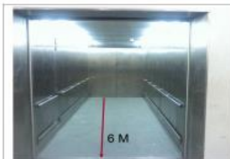
Door size 2.3 m. x 2.3 m. ขนาดประตู 2.3 เมตร x 2.3 เมตร