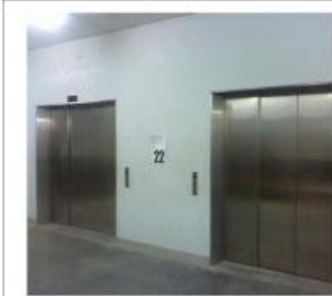
Area in front of the 2 cargo lifts level 22 ชั้น 22 ที่ตั้งบริเวณหน้าลิฟท์ขนส่งของชั้น 22